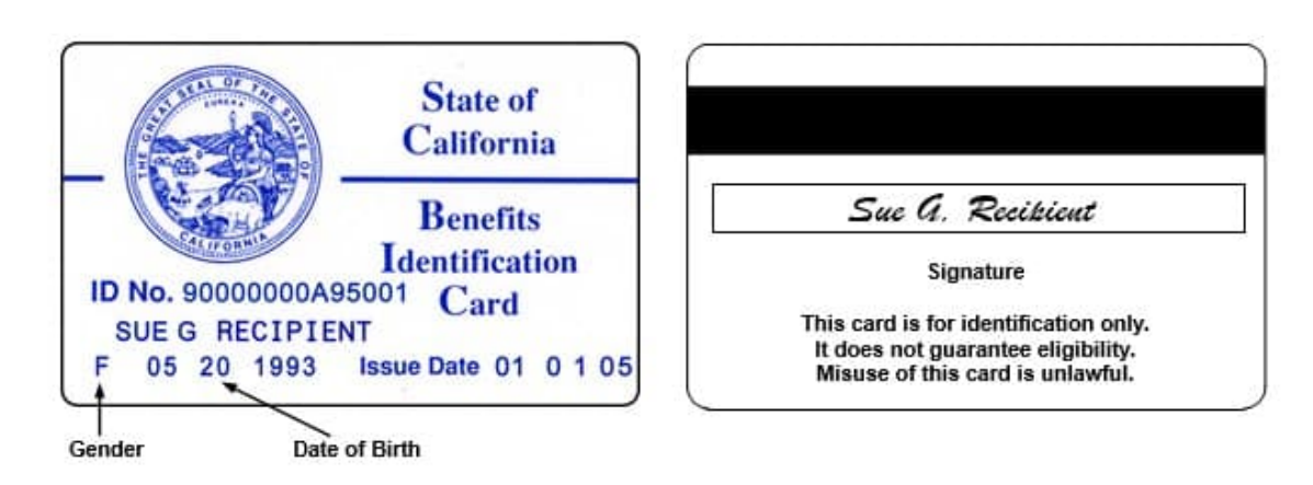
Sample BIC (Actual card size = 3 % x 2 % inches; white card with blue letters on front, black letters on back.)